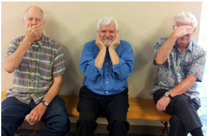
Speak no evil, hear no evil, and see no evil...